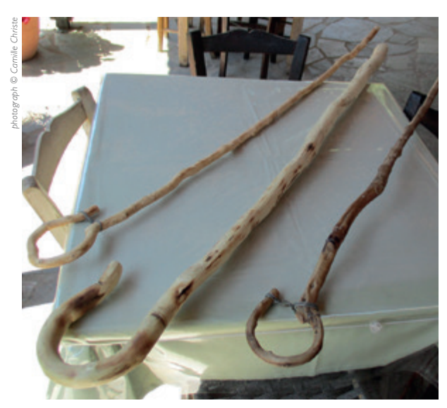
Katsounes or traditional shepherd sticks are made from different types of wood although Zelkova abelicea is preferred for its durability and lightness. In these examples, the far left stick is made from Zelkova abelicea, the middle one is Morus sp. and the right is from the wood of Olea europaea.

project activities are organised in villages next to Z. abelicea stands to increase local understanding of the project actions and the benefits of investing in a sustainable management of the species and more generally of the forested areas. Innovative ideas, contacts and collaborations have been created through the participation of local communities in these events. Moreover, a website dedicated to the project actions has been created (www.abelitsia.gr) both in Greek and English to promote the project to a wider audience. Other dissemination activities have been organized such as participation in national and international scientific congresses, production of project leaflets, setup of information panels in areas containing Z. abelicea that are easily accessible to the wide public and publication of new articles in the local media.