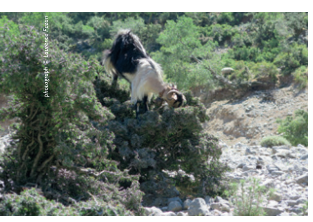
Left , Dwarfed individuals of Zelkova abelicea have gnarled and twisted forms due to strong browsing pressure from goats as well as sheep.

Opposite , One of the fenced plots established to protect severely browsed Zelkova abelicea individuals. After a few years of protection, the dwarfed trees will have reached sufficient height to escape the goats.