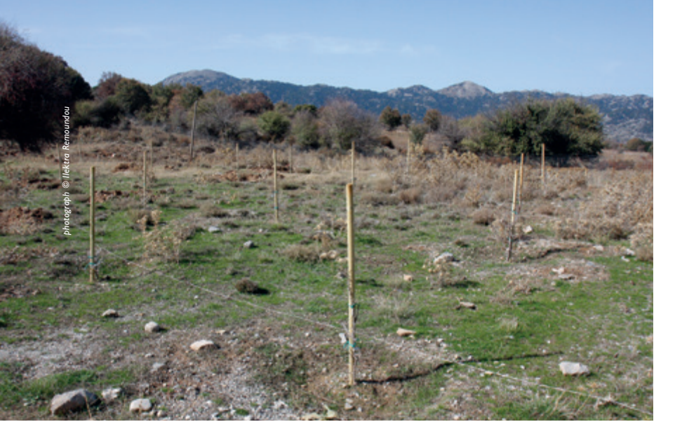
A plantation of Zelkova abelicea.